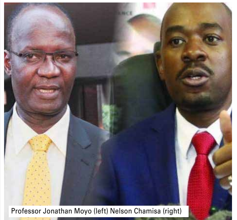
Professor Jonathan Moyo (left) Nelson Chamisa (right)

Added he: "There's nothing more dangerous in politics than, a young 'popular' dictator with a God complex. My conscience and freedom to political choices freely do not allow me to support a leader like that."