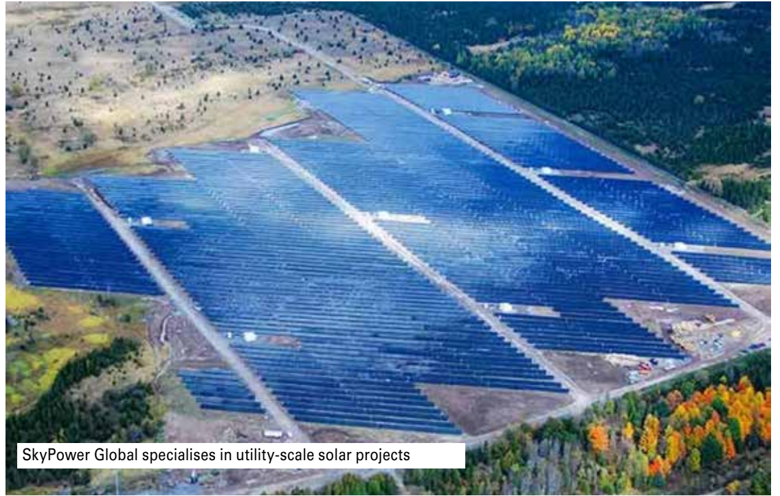
SkyPower Global specialises in utility-scale solar projects

Thankfully, Adler 'kept the lights on' and in 2009 secured investment from CIM – a community-focused real estate and infrastructure owner, operator, lender and