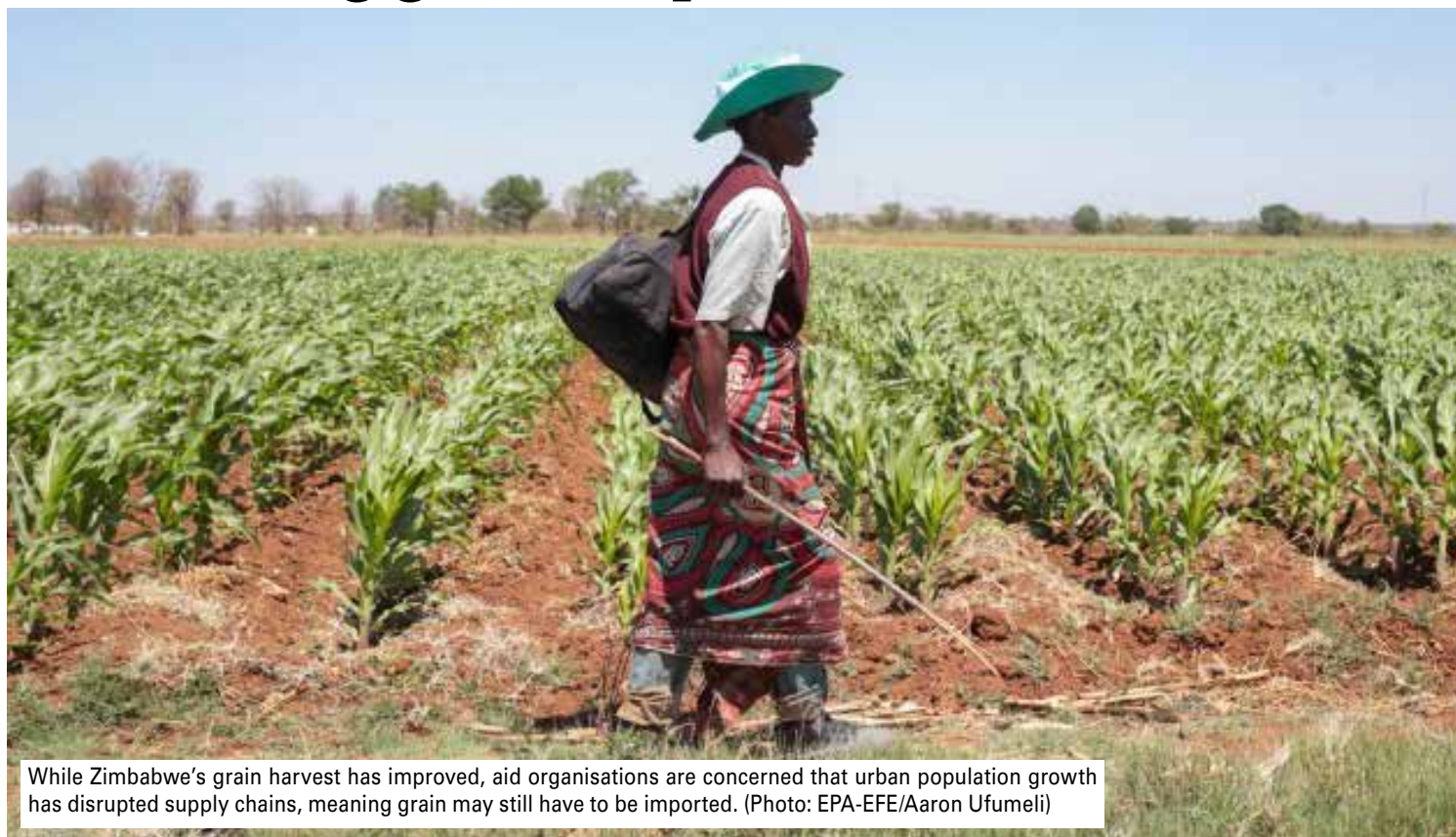
While Zimbabwe's grain harvest has improved, aid organisations are concerned that urban population growth has disrupted supply chains, meaning grain may still have to be imported.

Violent agrarian reforms and misgovernance pushed