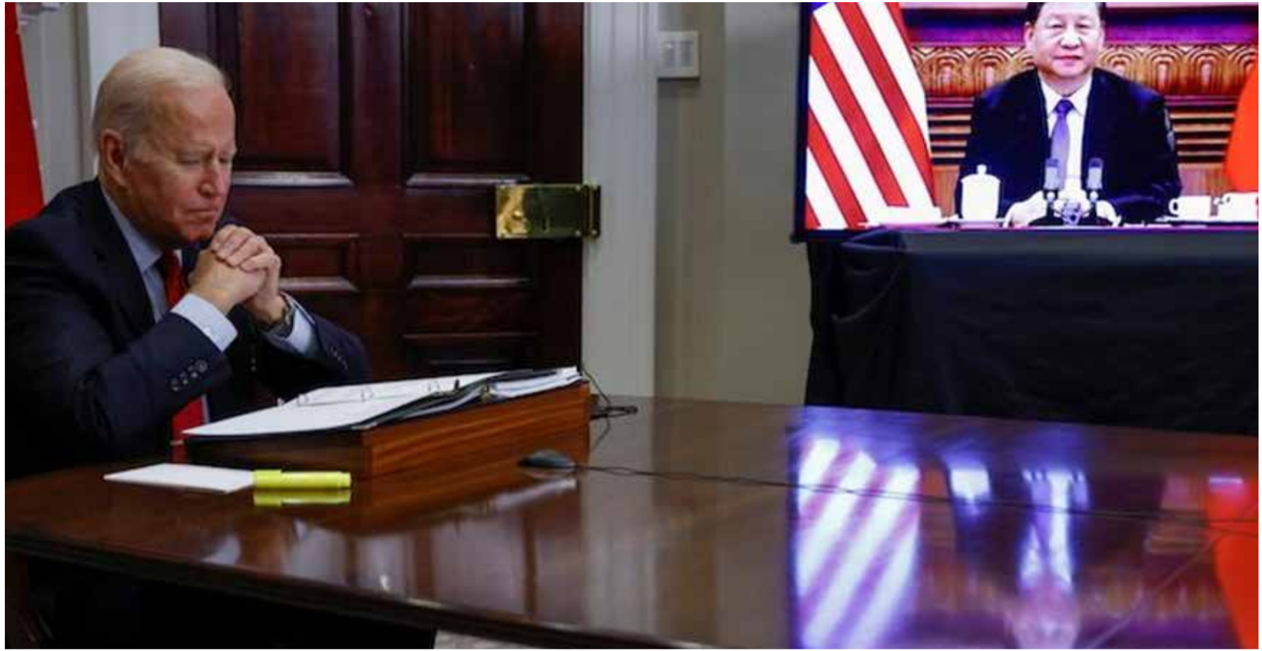
U.S. President Joe Biden speaks virtually with Chinese leader Xi Jinping from the White House in Washington, U.S. November 15, 2021.

The United States of America takes advantage of its financial hegemony and technological power and engages in economic coercion in the name of protecting national security. The United States has enacted a number of domestic laws, such as the International Emergency Economic Powers Act, the Global Magnitsky Human Rights Accountability Act, and the Countering America's Adversaries Through Sanctions Act, and has issued a number of executive orders to target and sanction specific countries, entities, or individuals.