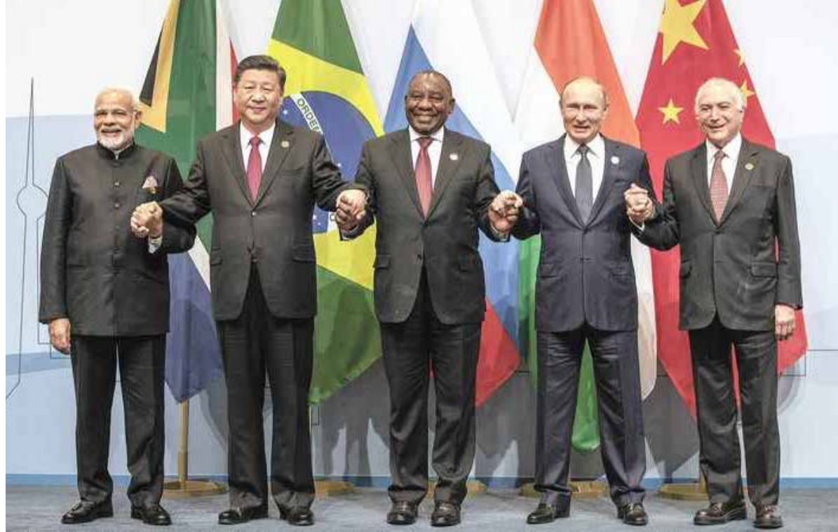
India's Prime Minister Narendra Modi, China's President Xi Jinping, President Cyril Ramaphosa, Russian President Vladimir Putin and Brazilian President Michel Temer during the 10th BRICS Summit.

Turkey, Egypt and Saudi Arabia are some of the other nations who also plan to apply for official membership.