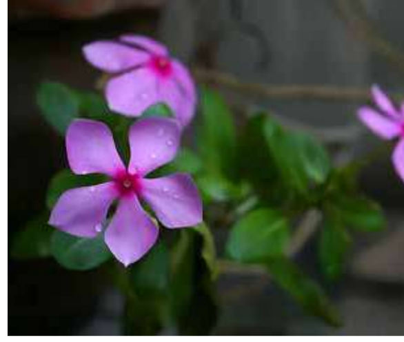
Catharanthus roseus , commonly known as bright eyes, Cape periwinkle, graveyard plant, Madagascar periwinkle.

Ouabain, a cardio glycoside, was isolated because of the way climbing oleander is used in traditional