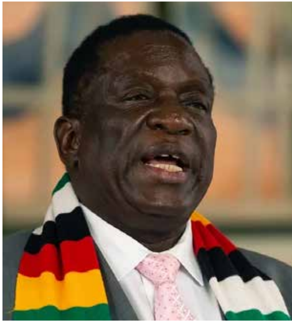
President Emmerson Mnangagwa

"Lately, we have witnessed attempts at interfering in our internal affairs by some Foreign Missions accredited to our country. This worrysome propensity is likely to get even more blatant closer to