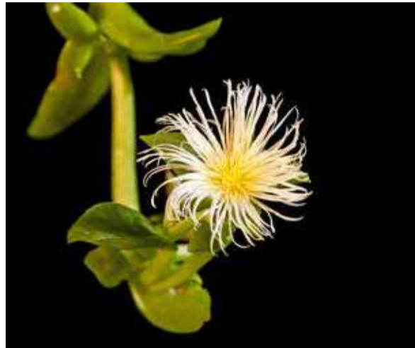
Sceletium tortuosum or Kanna blooming.